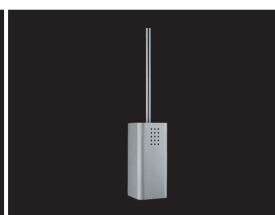
toilet brush holder PU-500