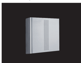
paper towel dispenser PU-100