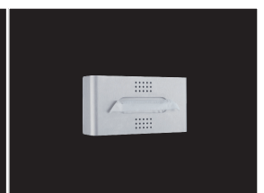
tissue dispenser PU-390