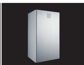
waste bin PU-200