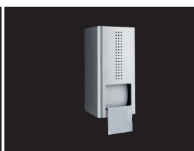
double toilet roll holder PU-300