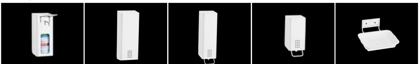
hospital dispenser SF-141-EB